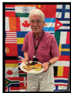
Enjoying the Opening Ceremony for the Olympics as we eat and drink around the world!