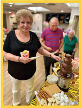
MAKE YOUR OWN FONDUE! WILLY WONKA CHOCOLATE EXPERIENCE!